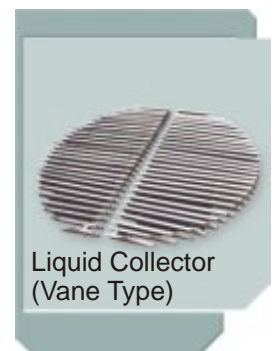
Liquid Collector (Vane Type)