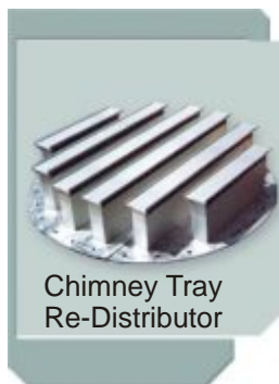
Chimney Tray Re-Distributor