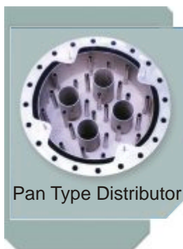
Pan Type Distributor