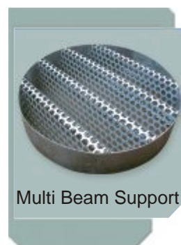
Multi Beam Support