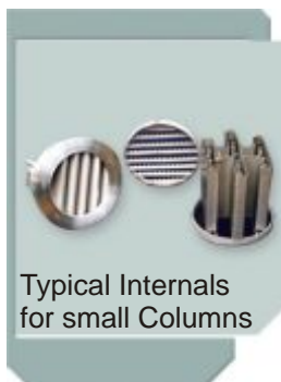
Typical Internals for small Columns