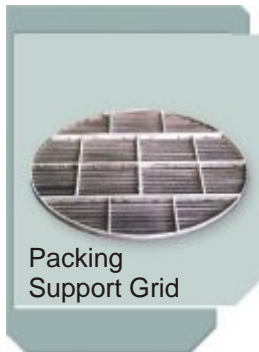
Packing Support Grid

A mass transfer tower also requires other internal equipments besides the packing or trays. Distributors, disperser plates and feed pipes spread the liquid and vapor within the tower. Collector plates capture liquid for removal from the tower. Packing support plates and bed limiters are used to physically support and retain packings inside the tower. Finepac™ manufactures tower internals in a variety of metals for use in virtually all mass transfer processes.